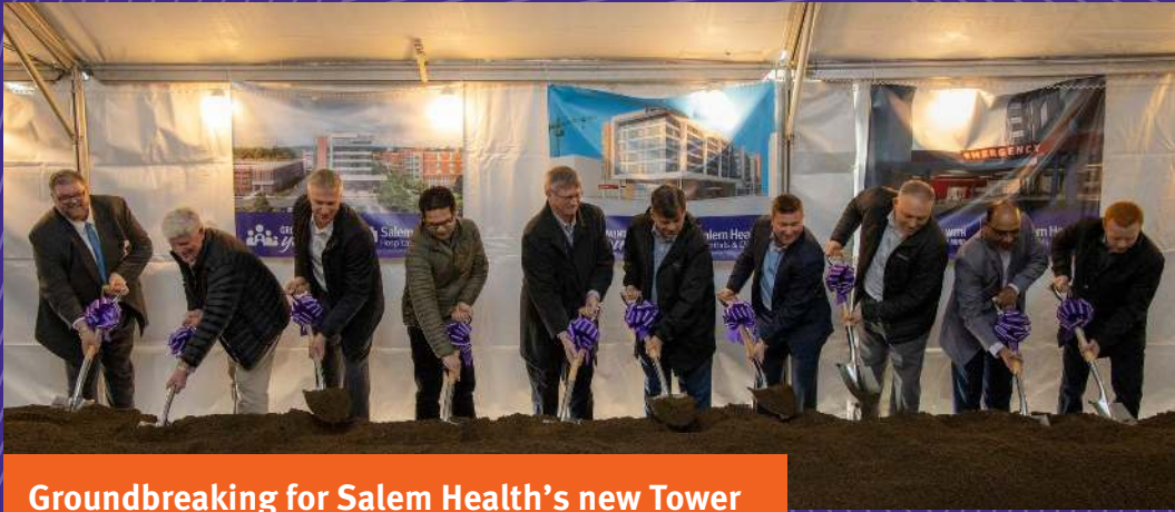
Groundbreaking for Salem Health's new Tower