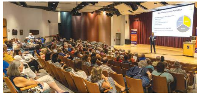
Mike Studer addresses the Salem audience.

Each session equipped attendees with practical strategies they could begin using immediately, regardless of age, mobility or fitness level. By framing health as a series of empowering choices rather than obligations, the lectures encouraged participants to take ownership of their wellbeing in realistic and sustainable ways.