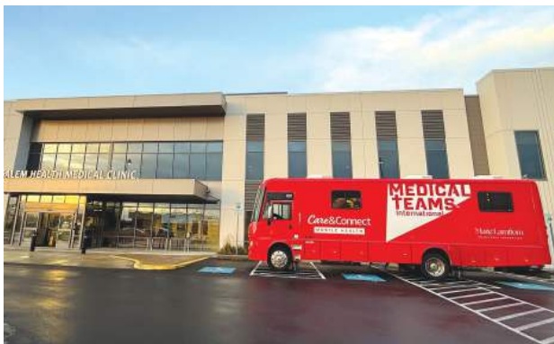
Free health screening with Medical Teams International in Woodburn, Oregon.

Salem Health is deeply embedded in the community, and hospital leaders work hand-in-hand with representatives from government agencies and other nonprofit organizations to assess and address community needs.